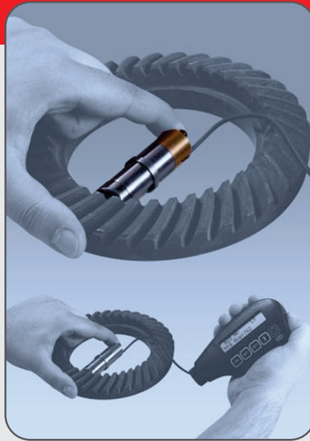
Probe Separating ability